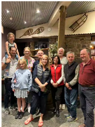
Work Party Participants from last year 17-19 May 2024 - more info see below