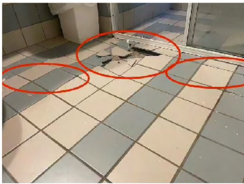
Broken and jutting up tiles in the spa bathroom