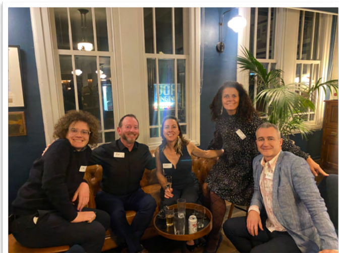
The opportunity to meet new members and socialise was excellent.