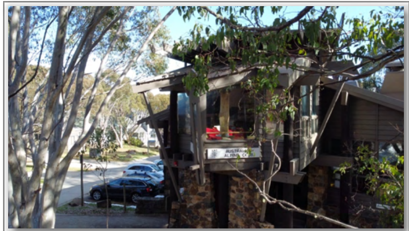
AAC Dinner Plain Lodge in

Geographically we are spread across Victoria and the ACT. We generally meet about 7-8 times per year for about 90 minutes per session, which is usually on a Monday evening at 7.30pm.